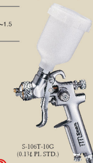
S-106T-10G (0.15L PL. STD.)